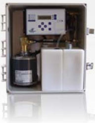
BDT Digital System