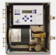
BMS Digital System